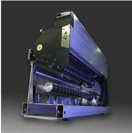
Application Example Textile Machine

software abandoning components of the drive system to save cost and space.