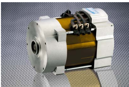
ABM Traction Motor as SINOCHRON ® Design

SINOCHRON ® -Motors developed by ABM Greiffenberger use high performance, permanent-magnets with sinusoidal magnetic field and even flux distributions. This allows speed sensors to be eliminated.